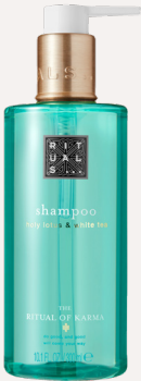
SHAMPOO 300 ml