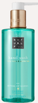
HAND WASH 300 ml