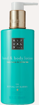
HAND & BODY LOTION 300 ml