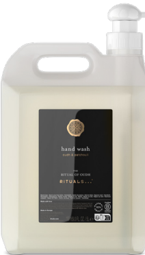
ALL REFILLS 5000 ml