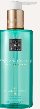
SHAMPOO & SHOWER GEL 300 ml