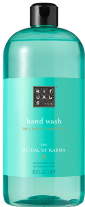
ALL REFILLS 1000 ml