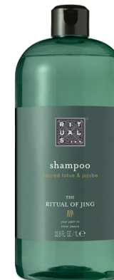
ALL REFILLS 1000 ml