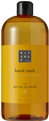
ALL REFILLS 1000 ml