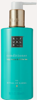
CONDITIONER 300 ml