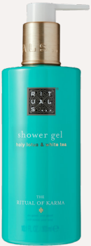
SHOWER GEL 300 ml