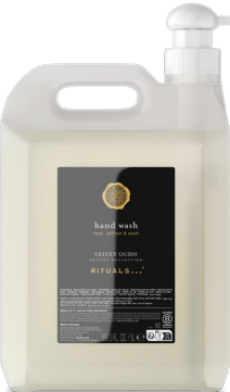
ALL REFILLS 5000 ml