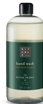
ALL REFILLS 1000 ml