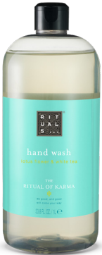
ALL REFILLS 1000 ml