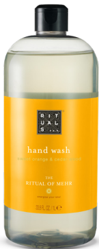
ALL REFILLS 1000 ml